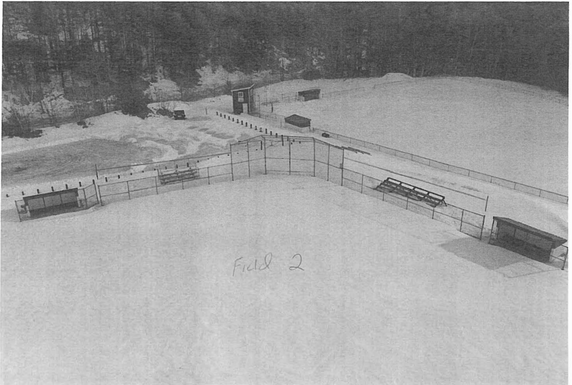
BRYANT BACKSTOP FIELD 2