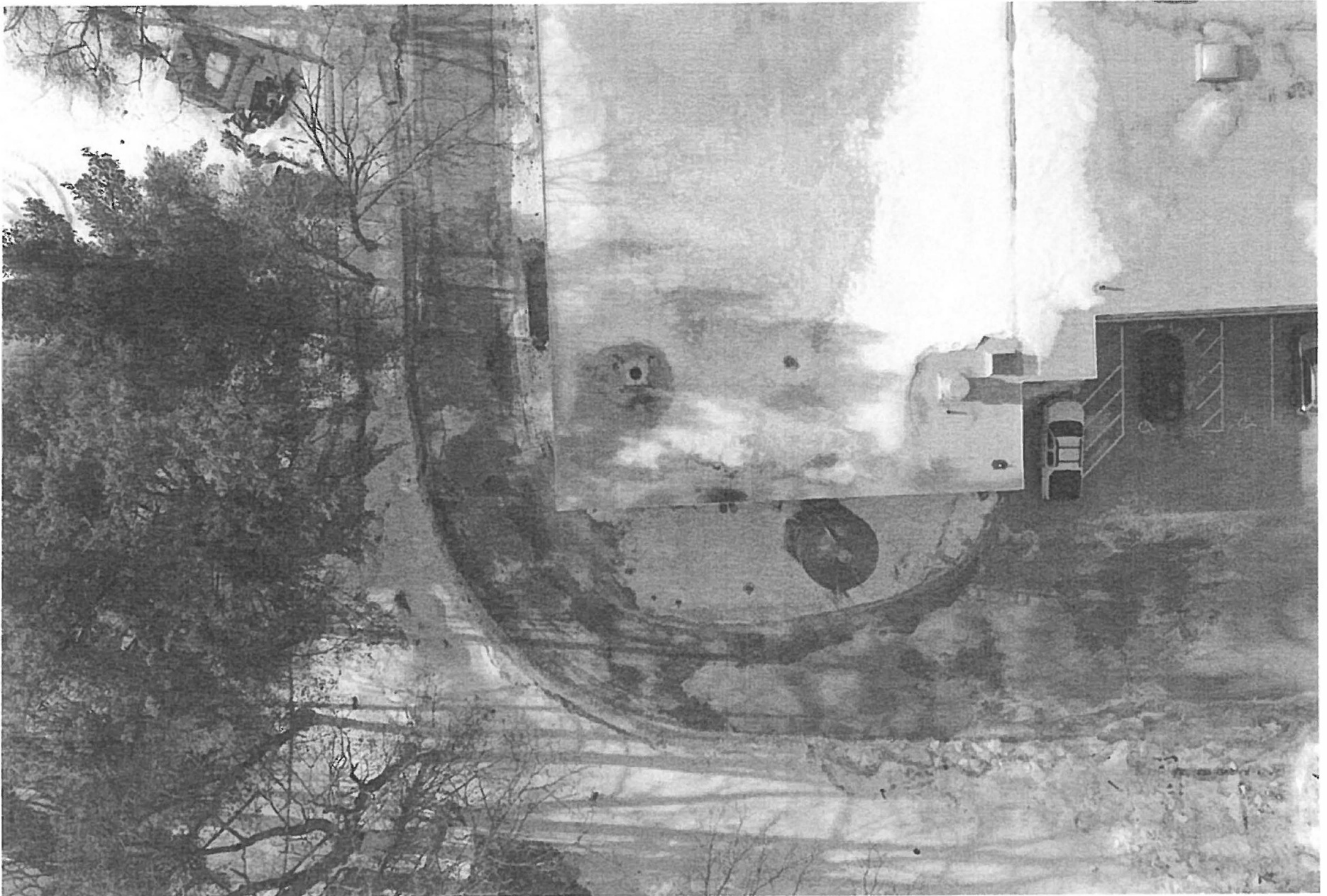
BMS SIDE DRIVEWAY