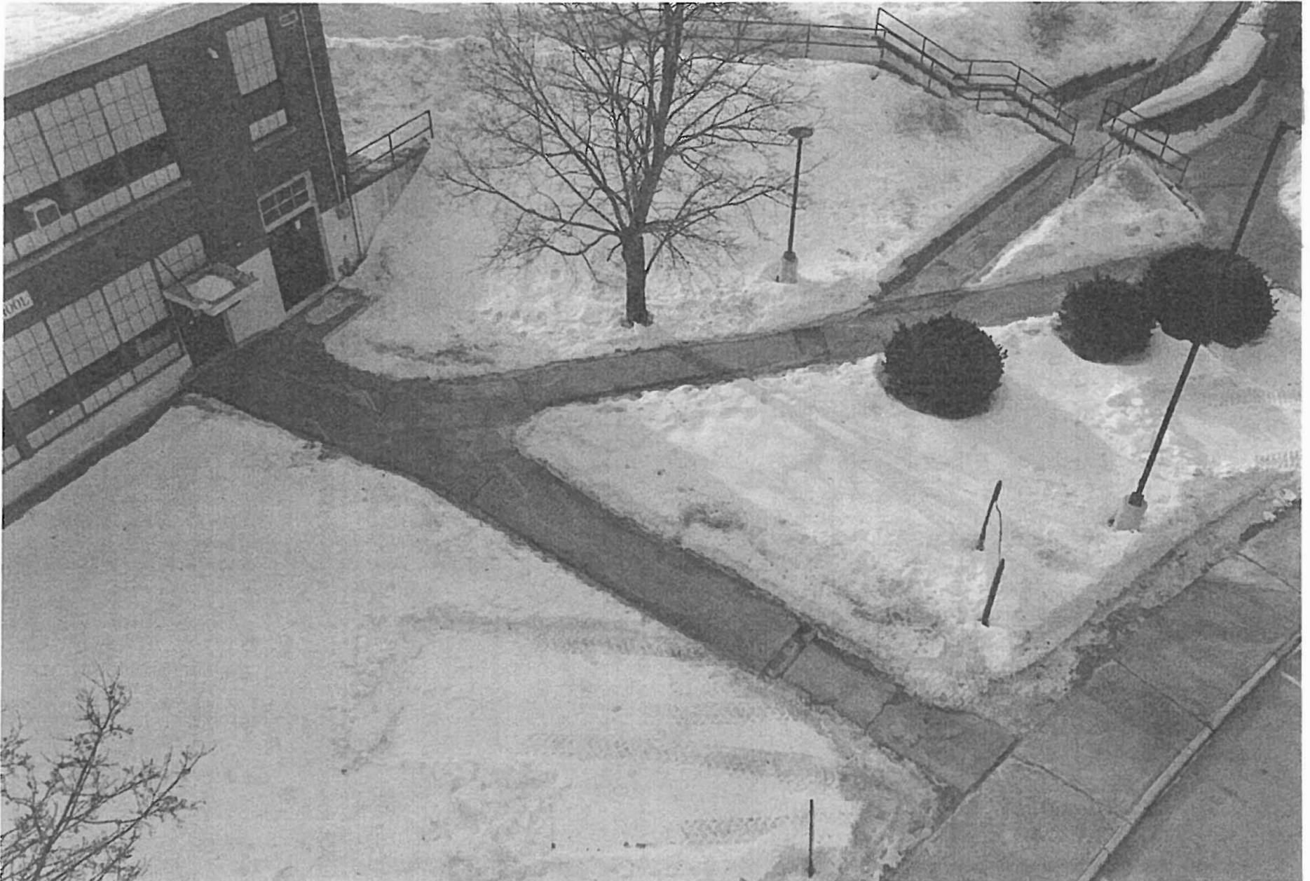
SAW BUILDING WALKWAY