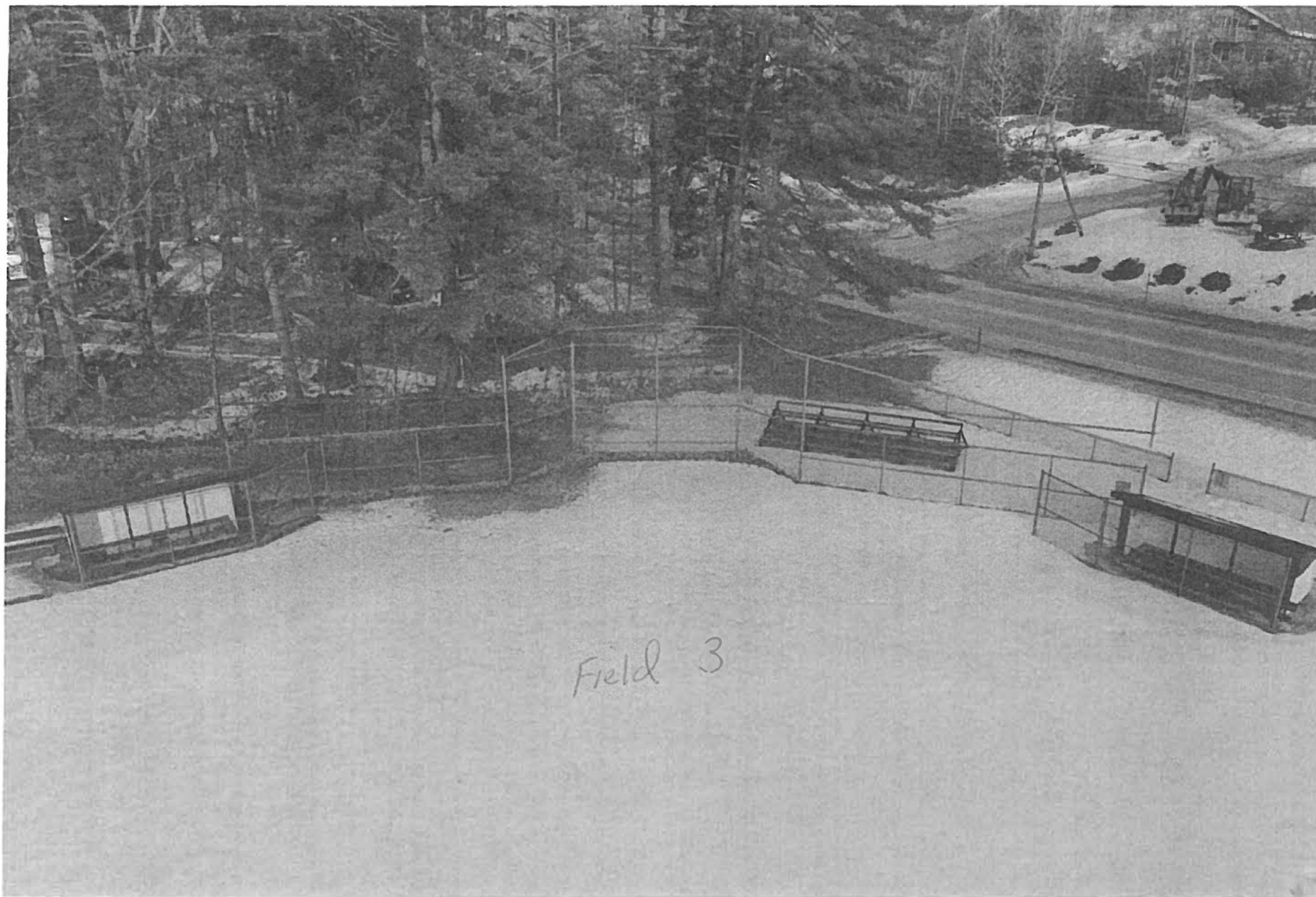
BRYANT BACKSTOP FIELD 3