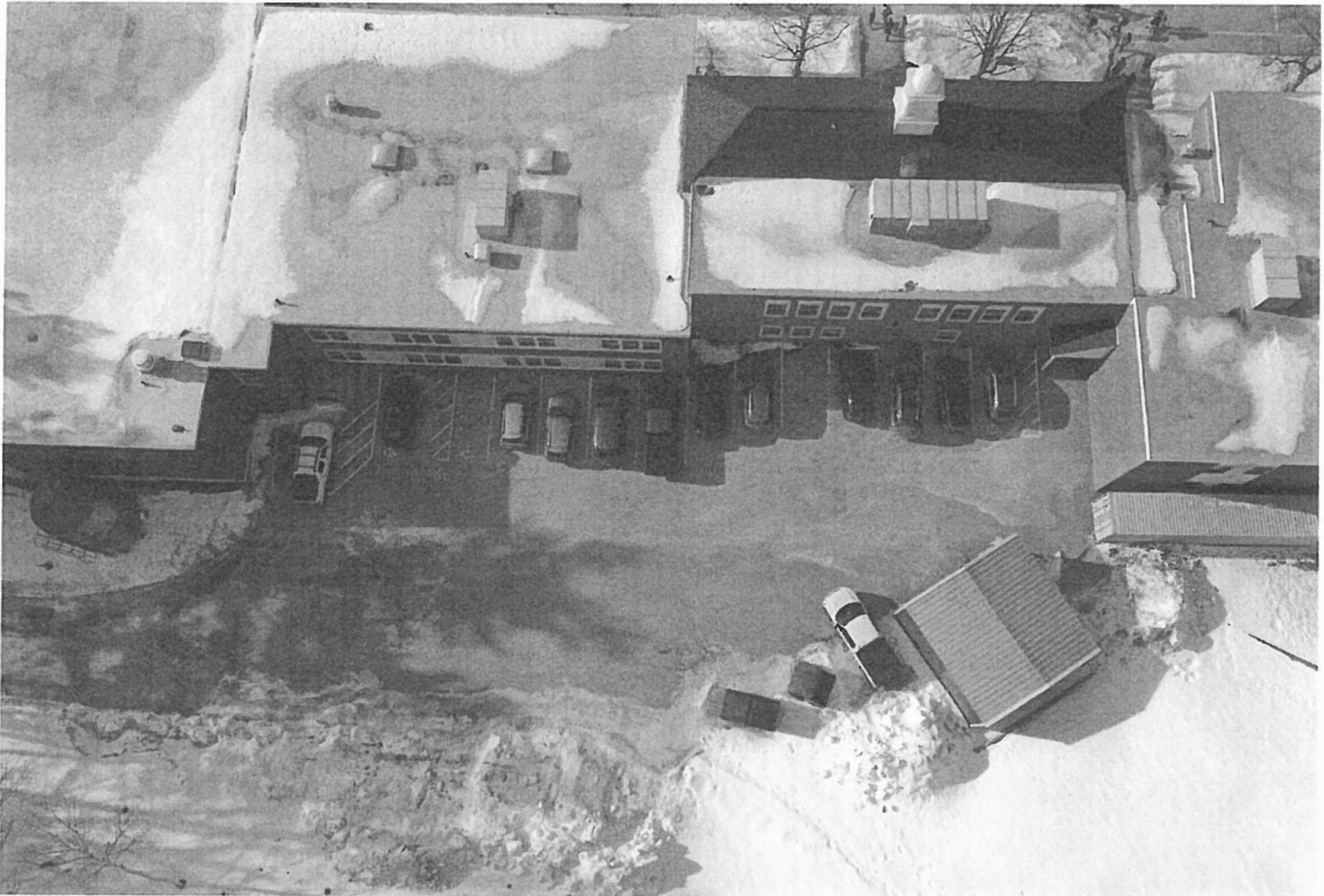
BMS REAR PARKING LOT